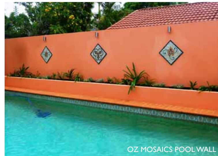
OZ MOSAICS POOL WALL