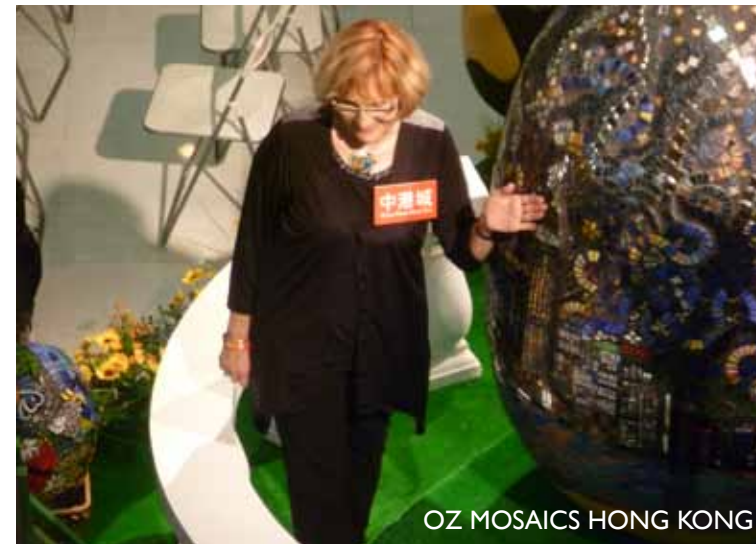
OZ MOSAICS HONG KONG