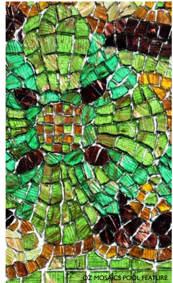
OZ MOSAICS POOL FEATURE