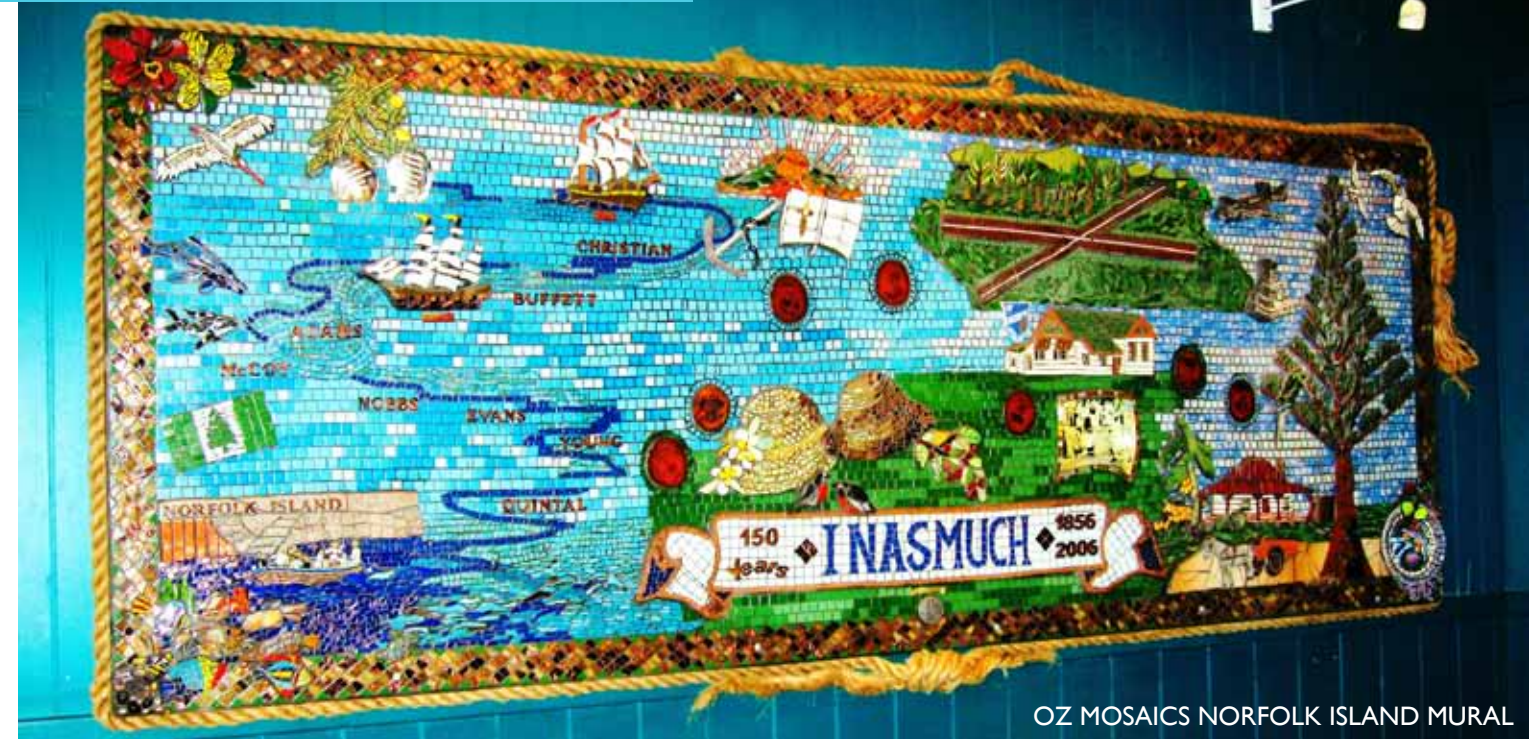
OZ MOSAICS NORFOLK ISLAND MURAL