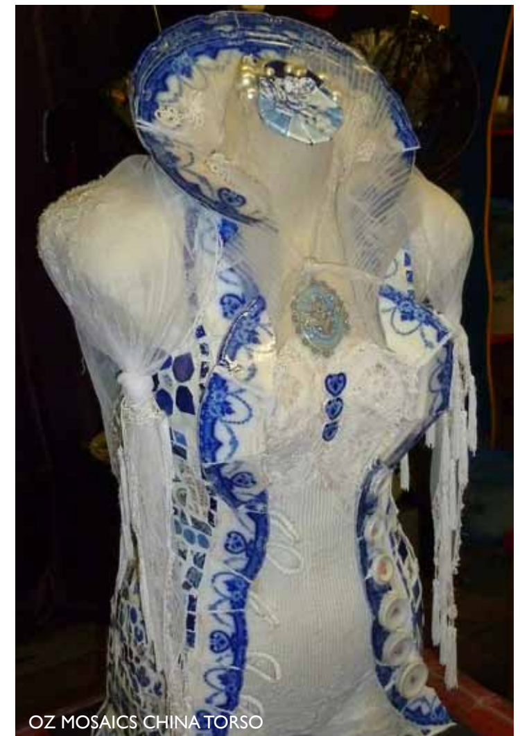
OZ MOSAICS CHINA TORSO

Apart from client commissions, workshops and several large community anniversary murals in 2013, my current focus is working on the release of MOSI (Mosaic Online School Int.). Students may enrol in MOSI, to keep updated with mosaic tips/tricks, online tutorials, exciting mosaic projects and more! I have introduced new smalti workshops this year and students will select from over 264 colours of Dynasty smalti!