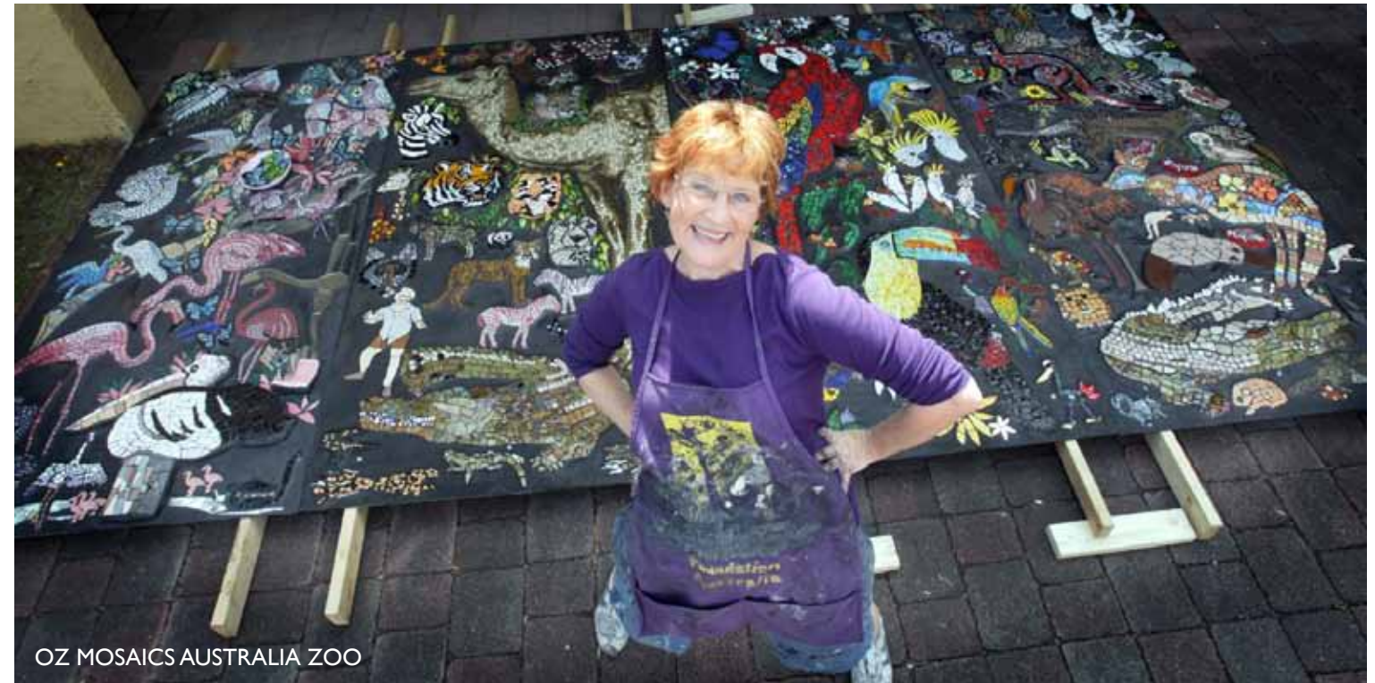
OZ MOSAICS AUSTRALIA ZOO